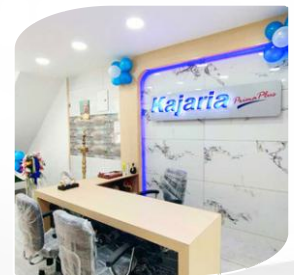
Kajaria, Sikandrabad, Uttar Pradesh