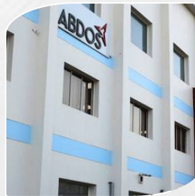
Abdos Labtech, Roorkee, Uttarakhand