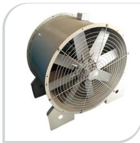
Axial Flow Fans