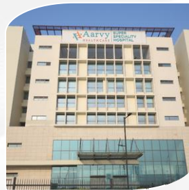
Aarvy Hospital, Manesar, Haryana