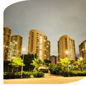
Suncity Parikrama, Panchkula, Haryana