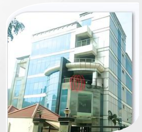
Kalyan Herbal, Gurugram, Haryana