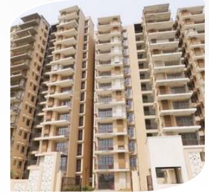
Synera, Gurugram, Haryana