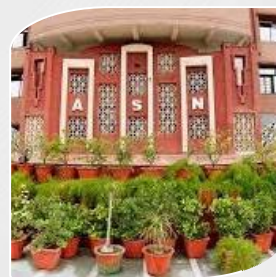
Adarsh Shiksha Niketan Senior Secondary School, Delhi