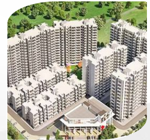
Grand IVA, Gurugram, Haryana