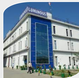
Luminous, Gurugram, Haryana