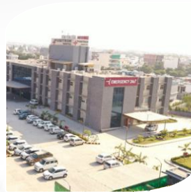
Positron Super Specialty & Cancer Hospital, Rohtak Haryana