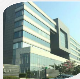
Success Tower Gurugram, Haryana