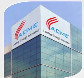
ACME Gurugram, Haryana