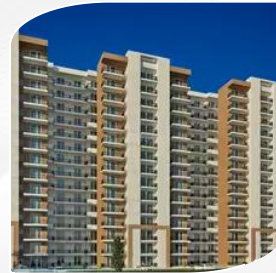
Orchard Gurugram, Avenue, Haryana