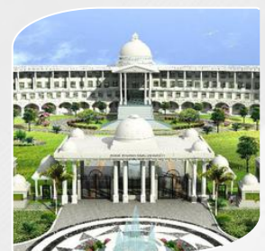
Noida International University, Noida, Uttar Pradesh