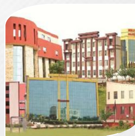
WCTM - Engineering College, Gurugram Haryana