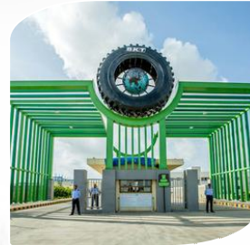
BKT Tires, Bhuj, Gujarat