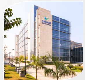
Jubilant, Noida, Uttar Pradesh