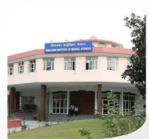
SRHU Medical College & Hospital, Dehradun, Uttarakhand