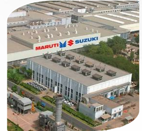
Maruti, Manesar, Haryana