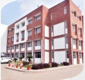
Bal Bharati Public School-IMT Manesar, Haryana