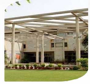
Sitaram Bhartia Institute of Science & Research, Delhi